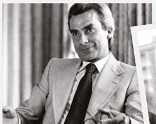
Francisco Sá Carneiro

The Law School is one of the 18 schools of the University of Lisbon, the largest university in the country and one of the oldest; the successor of the former Technical University of Lisbon and University of Lisbon, resulting from the merger between the two institutions.