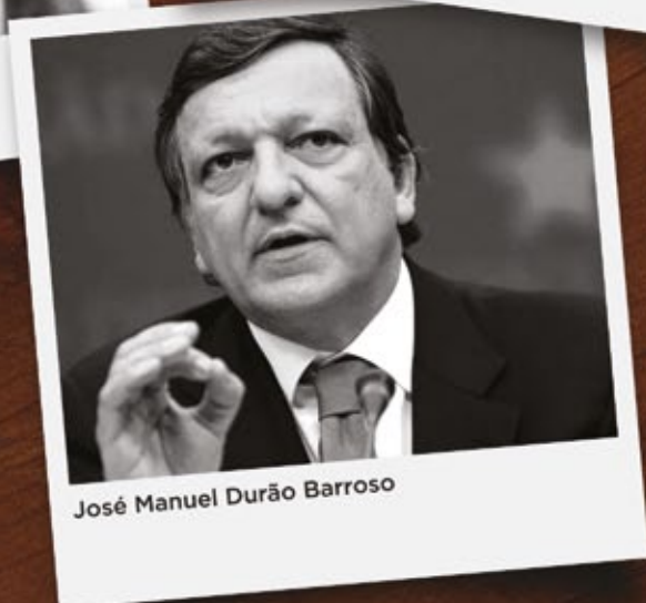
José Manuel Durão Barroso